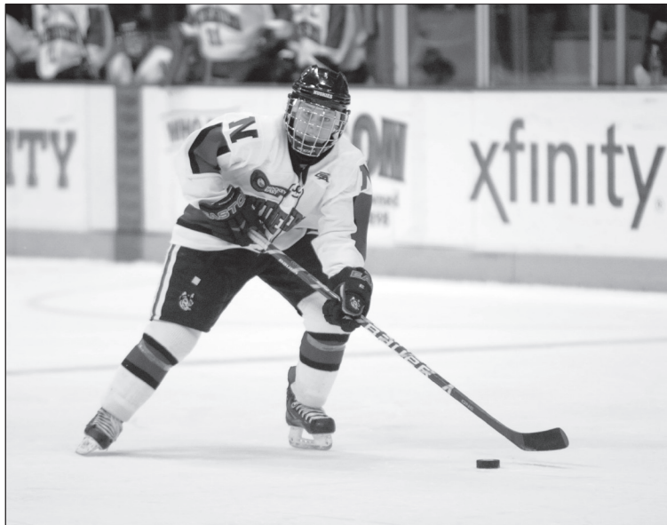
Freshman forward Kendall Coyne was named USCHO All-Rookie of the Year and earned a spot on the All-New England Division I All-Star team.

The Huskies finished the season with a 22-7-4 record and the program's first Hockey East regular season title.